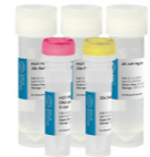
HOT FIREPol® DNA Polymerase