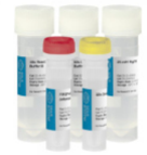
FIREPol® DNA Polymerase